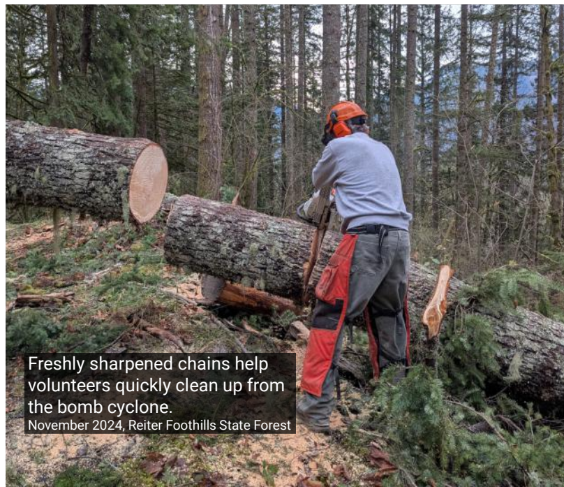
Freshly sharpened chains help volunteers quickly clean up from the bomb cyclone. November 2024, Reiter Foothills State Forest