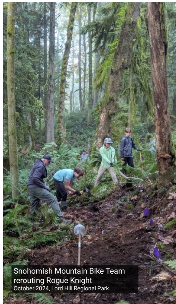
Snohomish Mountain Bike Team rerouting Rogue Knight October 2024, Lord Hill Regional Park