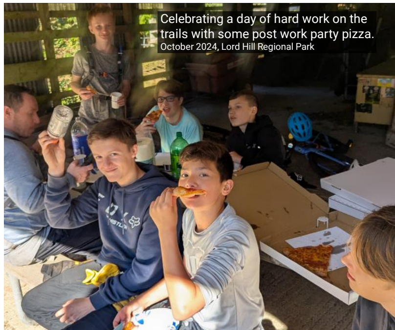
Celebrating a day of hard work on the trails with some post work party pizza. October 2024, Lord Hill Regional Park