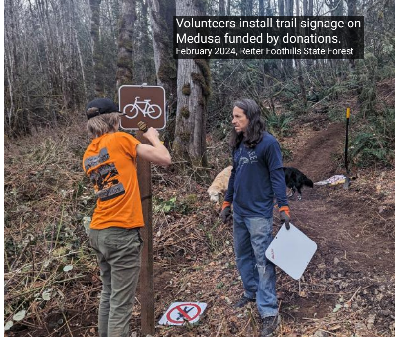
Volunteers install trail signage on Medusa funded by donations. February 2024, Reiter Foothills State Forest