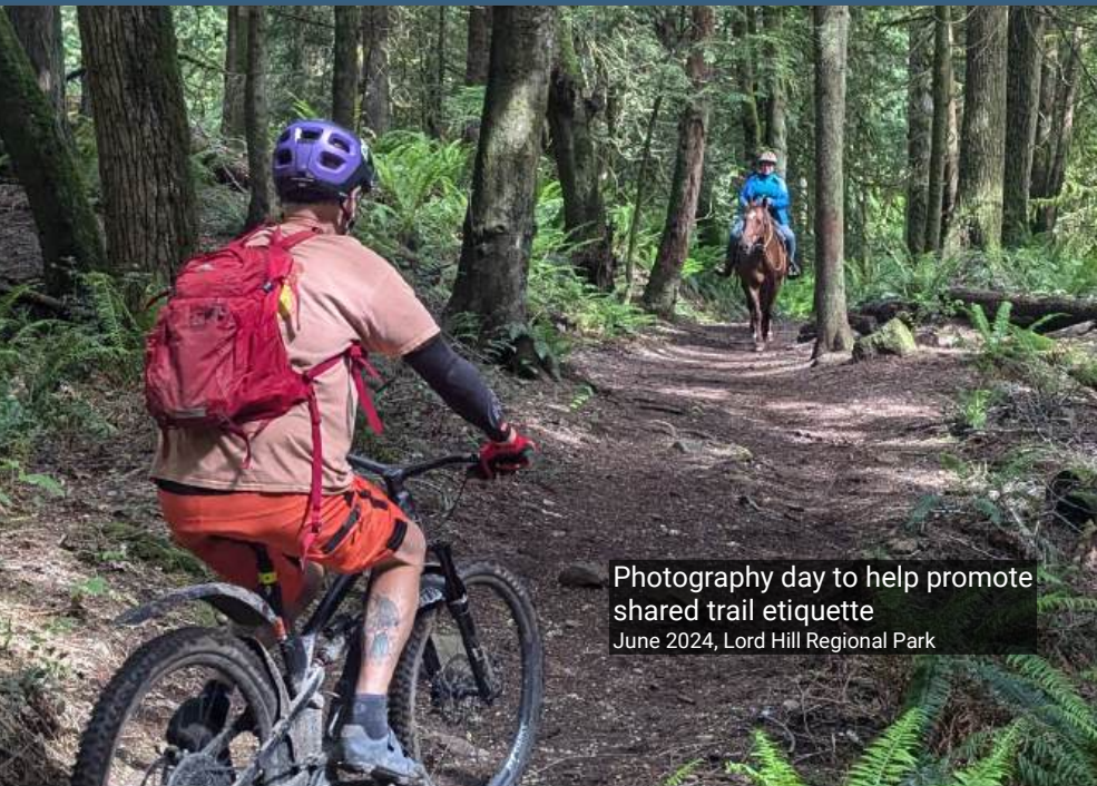
Photography day to help promote shared trail etiquette June 2024, Lord Hill Regional Park